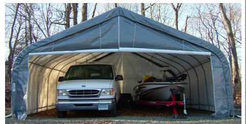
Two Car Garages