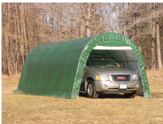
One Car Garages