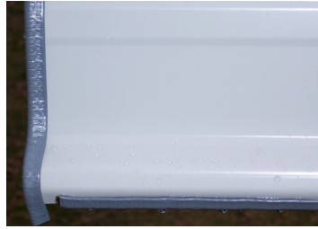
Easily applied edge coping provides a finished edge