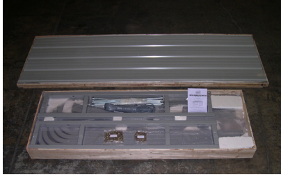
Ships in all wood crates