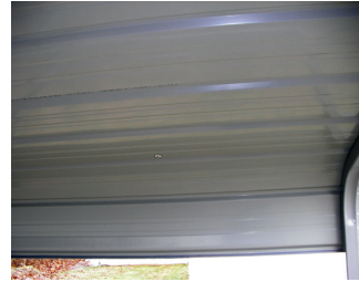
Weather resistant all-steel roof