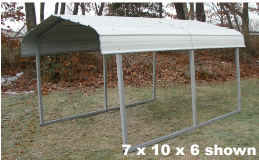
7 x 10 x 6 shown